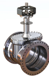
Flanged STV 986/041-000