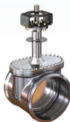
Buttwelded ends STV 986/051-000

Gearbox, pneumatic, hydraulic and electric actuators, position indicators, solenoid valves, positioners