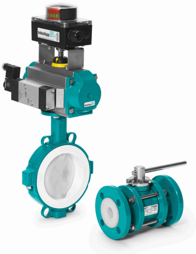
Bianca, PTFE-lined butterfly valve, TLBVA23, PFA-lined ball valve

Butterfly valves from InterApp have convinced in several sulfuric acid plants around the world like e.g. in South Africa, Namibia and Australia.