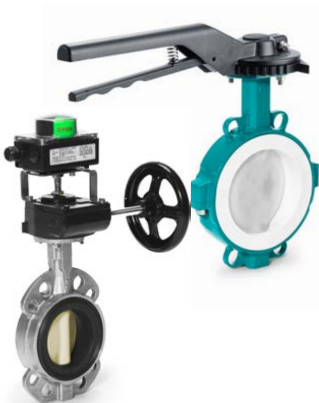
Desponia® plus, EPDM-lined butterfly valve and Bianca, PTFE-lined butterfly valve

The main benefits are the broad experience and sound knowledge of our specialists, the wide range of products and accessories, the durability and performance of the valves, and – last but not least – the expertise, the reliability and dedication of the people at InterApp.