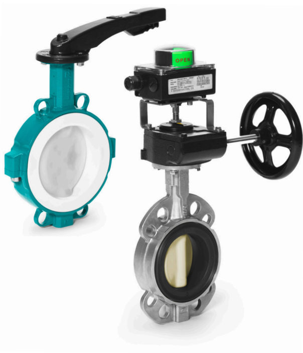
Desponia® plus, EPDM-lined butterfly valve and Bianca, PTFE-lined butterfly valve

The main benefits are the broad experience and sound knowledge of our specialists, the wide range of products and accessories, the durability and performance of the valves, and – last but not least – the expertise, the reliability and dedication of the people at InterApp.